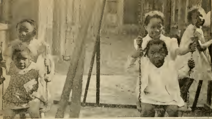
In crowded cities, playgrounds mean much to the child